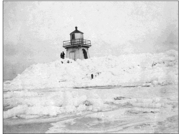
Ice piled near the Port Clinton Pier Light early 1900s

Northern Ohio Telephone Company provides regular employment to 61 men and 36 women. It has an annual payroll in Ottawa County amounting to $368,051.32 and paid county taxes in 1964 amounting to $113,066.10.