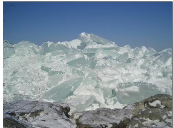
Ice piled near the former Moose Club January 2018